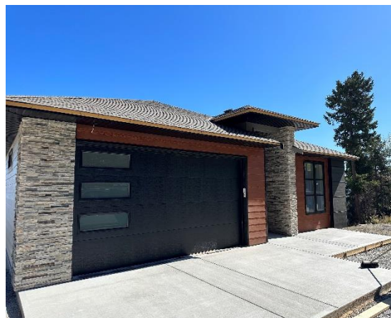
Glenrosa custom home rebuild