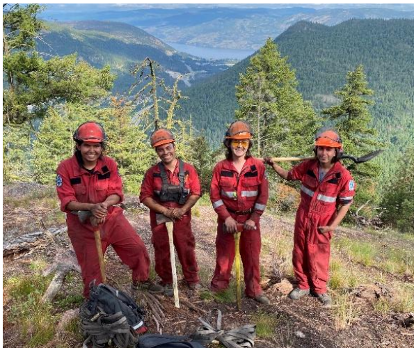
Ntityix Resources suppression crew on the fire line

"Ntityix Resources is implementing strategies to help reduce the impacts of wildfires by conducting fire mitigation projects near communities..."